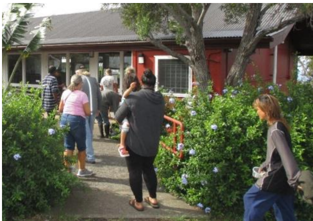
Line up outside the church for sandwiches.

The sandwich plan proved to be problematic in procuring the grocery supplies and the cost was nearly three times that of our regular soup menu. So, it was decided to return to serving soup in a portable container, and keep the social distance serving line, outside of the church building.